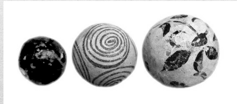
Chuiwan balls from the Song Dynasty

Cycling from Dai Temple in Shandong Province to Taiyuan and finishing in Hothhot (Inner Mongolia). In total 1099 kms following the route of golf in ancient times that made its way to Europe.